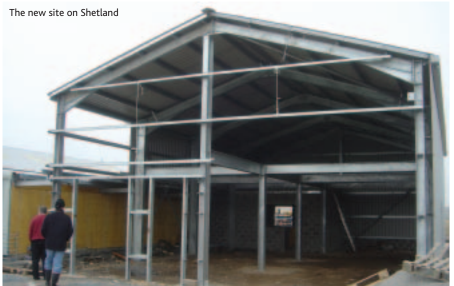
The new site on Shetland

The water is filtered across a UV light so any impurities are instantly destroyed. Isle of Shuna strongly approves of anything that keeps our mussels in tip top condition for as long as possible.